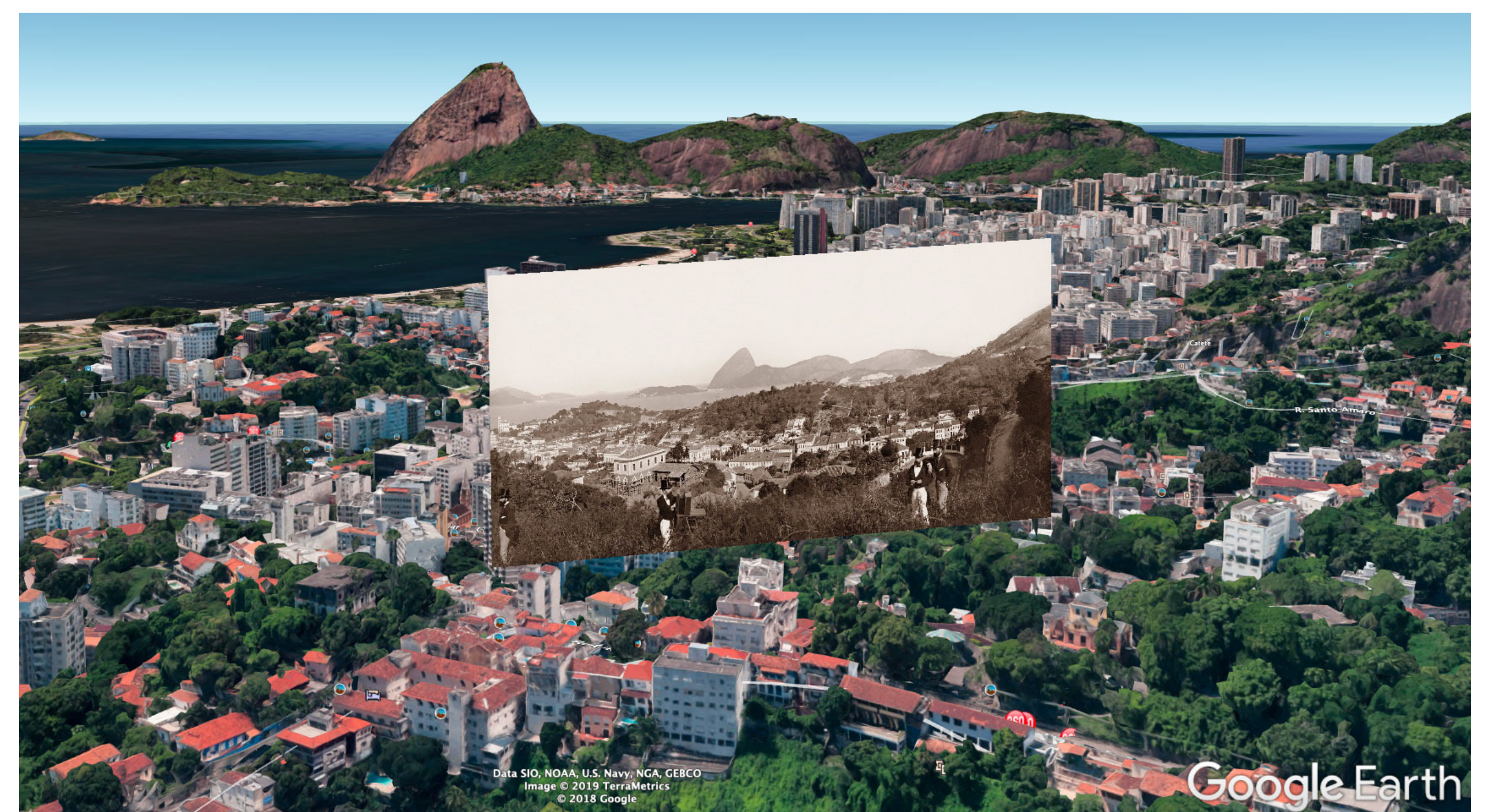
Juxtaposition of a photograph of Marc Ferrez in the three-dimensional model of Rio de Janeiro's urban space.

Once the tour is finished, the guest can play and interact with it using the touchscreen and the 3D controller. The touchscreen shows a grid of thumbnail scenes, each one corresponding to a photo taken in a different place in Rio. The joystick controller enables 6-axis navigation within a scene. In this demo, guests are invited to use the controller to navigate GE while comparing the current view of the city with the past view registered by the photographer. A video of the demo can be watched on https://youtu.be/yZpTpdq-j14