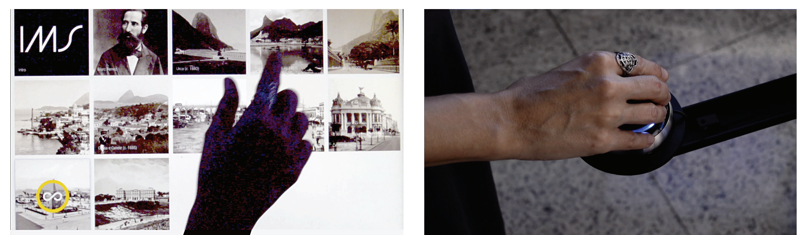
LG's touchscreen and 3D controller.