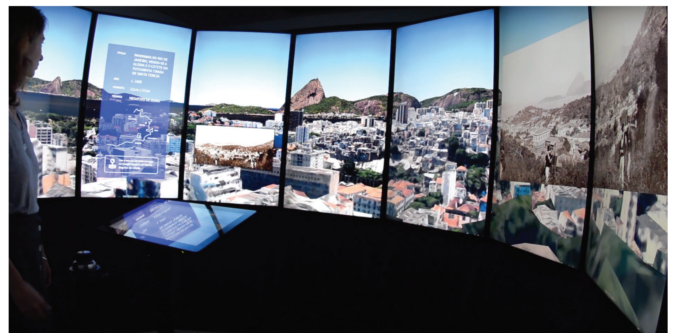
A scene of LG presentation: on the background, GE shows a KML file with a PhotoOverlay image (a geolocated photograph); on the foreground, 2D graphics shows a metadata infobox and a high-resolution version of the Ferrez's photograph.