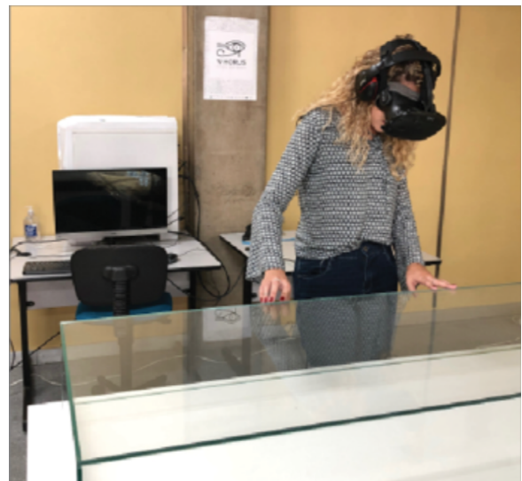
Figure 3: Installation set up.

In order to deploy and test the experiment, an installation was constructed that consisted of a table set up in the experiment site. On the table, a glass box similar to the one in which the Roman mummy was exhibited at the National Museum, but empty, representing the absence of the artifact. In the virtual environment, the showcase and the table served as a physical reference and had the function of making the experience more realistic, since the participants could touch them while viewing the mummy on a table in the virtual environment. In this setting, only one person at a time participated in the experience. (See Fig. 3)