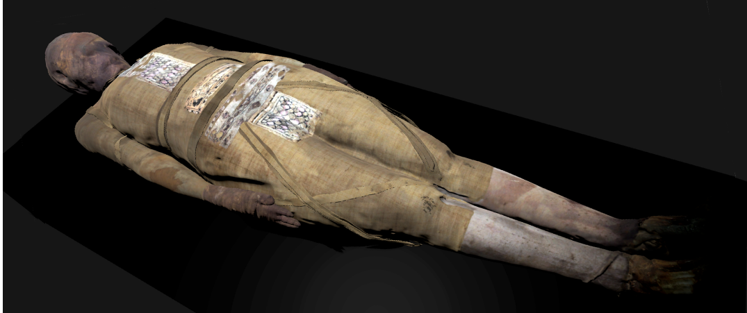
Figure 1: The Roman Mummy.