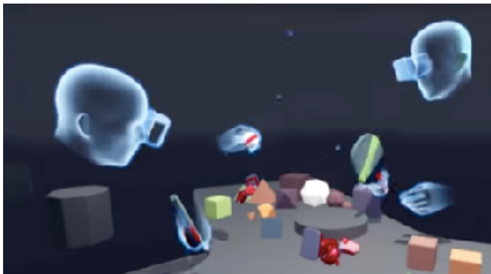
Avatars for Host and Participants